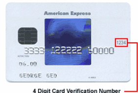
Sample Amex Card